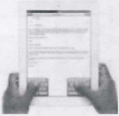
The New iPad®

Sign up for activities* in the Celebrity iLounge and learn about the apps and features for your iPhone®, iPad®, and iPod Touch®.