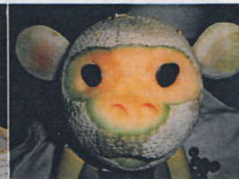
A Puppy (from Cantelope)