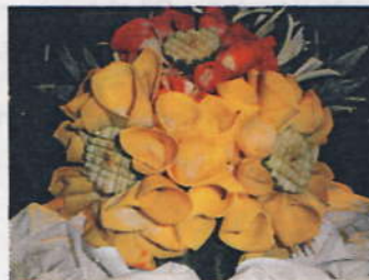
Bouquet of Flower (from Mix of Fruits and Veg)