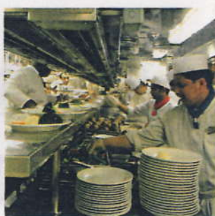
Culinary Team in Action