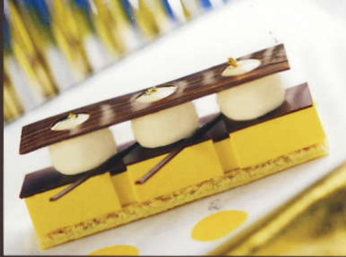
SABLE BRETON WITH EXOTIC CREAM AND WHITE CHOCOLATE BAVARIAN