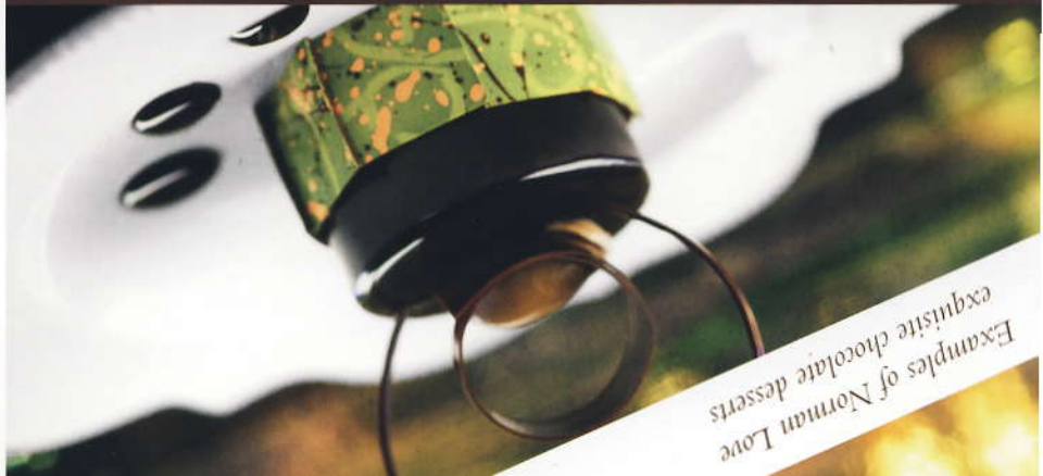
BITTERSWEET CHOCOLATE MOUSSE WITH CARAMEL CREAM AND MILK CHOCOLATE CRUNCH