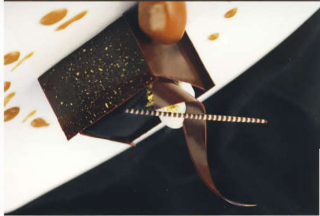
CHOCOLATE TIRAMISU, MASCARPONE CREAM AND ESPRESSO GELATO